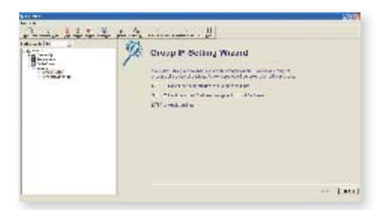
Monitoring and Configuration interface