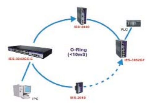
TO SEE SHOW SHE 1580

ORing's switches are intelligent switches. Being different from other traditional redundant switches, ORing provides a set of Windows utility (Open-Vision) for users to manage and monitor all of industrial Ethernet switches on the industrial network.