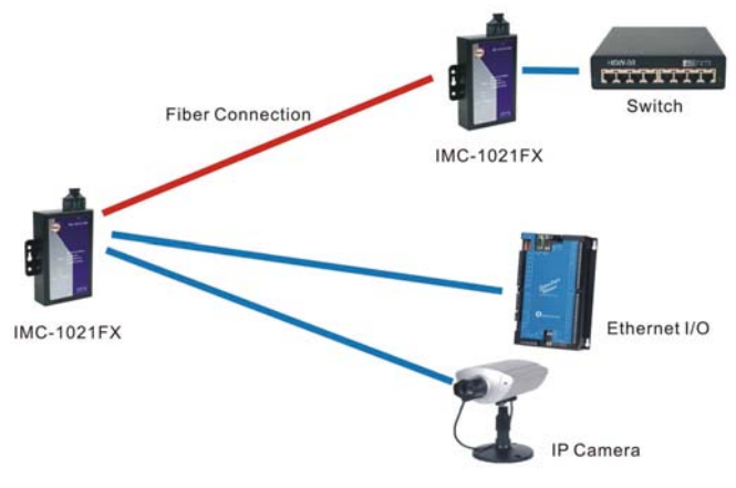
Connections of Media converter

IMC-1021FX are industrial media converters provide media conversion between 10/100Base-T(X) and 100Base-Fx. IMC-1021FX series are rigid IP-30 housing design and supporting an operating temperature of -10 to 60°C, and an extended operating temperature (T models) of -40 to 70°C. Therefore, the IMC-1021FX are reliable media converters and can satisfy most demand of operating environment.